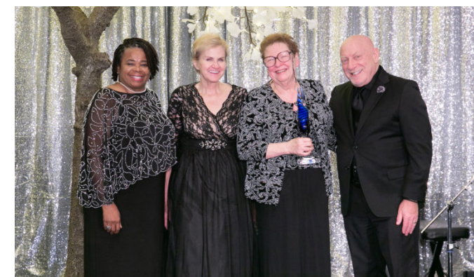
Brown Eagle is an award-winning company. In 2019, it won the coveted "Supplier of the Year Award" from the Women's Business Enterprise Council South, and in 2020, it was recognized for its focus on safety and was named one of LWCC's "Safest 70 for 2020."

company, she relishes the opportunity to recognize and celebrate her employees' achievements.